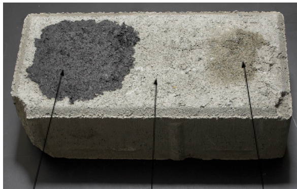
Image 1. Before Civilox application

We allowed the Civilox coating to cure for 7 days before adhesion testing.